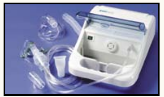
Bestneb Nebuliser Pump

The Bestneb Nebuliser Pump has been designed with children in mind to make respiratory therapy a less frightening experience. Along with a super quiet operation, the Bestneb Nebuliser Pump should be your first choice when considering a nebulisation unit for the home or surgery!