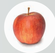
LED HQ : red is red