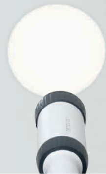
This is LED HQ : Light in HEINE Quality