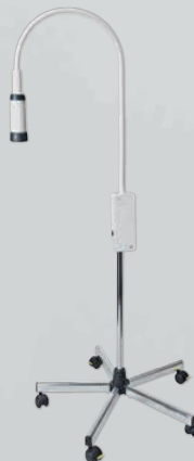
EL10 LED Examination Light on wheeled stand, metal base

For further information please refer to: www.heine.com