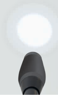
This is a conventional LED

The compact illumination head (Ø app. 60 mm) allows an almost coaxial illumination, particularly in difficult application situations.