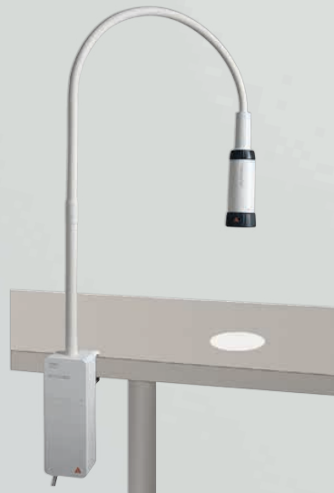
EL10 LED Examination Light with clamp mount

HEINE makes no compromises in manufacturing high quality medical instruments. Our commitment to vertical integration in manufacturing means we control all aspects of our instrument quality, from utilising carefully selected, well-matched materials to a high level of hand assembly. This ensures that each HEINE instrument meets or exceeds all requirements in any medical environment. We stand behind this commitment with a 5 year guarantee!